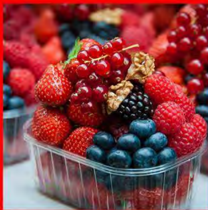
PUNNETS OF BERRIES